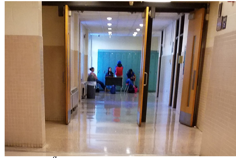
Students congregate at a hall station during passing period

Though crowding in hallways is harder to alleviate, some students feel like hallway control isn't strict