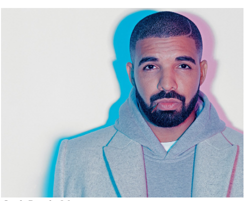
Study Breaks Magazine

After a hiatus, Blackpink released the hit single above, an upbeat tune featuring strong vocals from each member. With this song, they made history with the highest chart ever by a K-pop girl group on the billboard 100: peaking at #55.